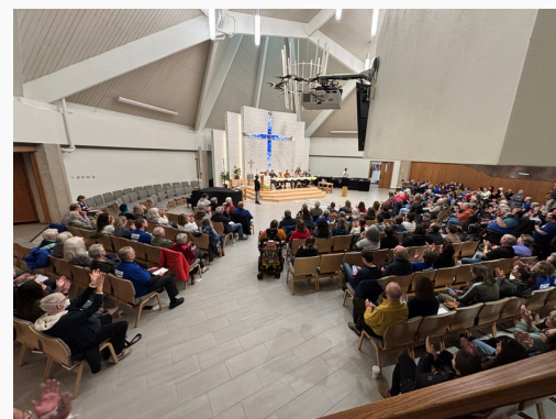
Common Cause Minnesota's Rochester Townhall

On March 1st Common Cause Minnesota worked with local partners to host a 200+ person town hall in Rochester to increase constituent access to legislators and local elected officials. Read more here!