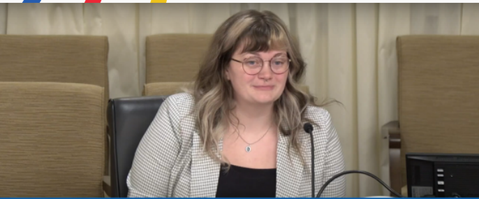
House File 550 Bipartisan Redistricting Commission established, principles to be used in adopting legislative and congressional districts established, and constitutional amendment proposed. MN House Monday, February 24, 2025

Our Policy & Civic Engagement Manager testifying against HF 550 in the House Elections Committee on 2/24.