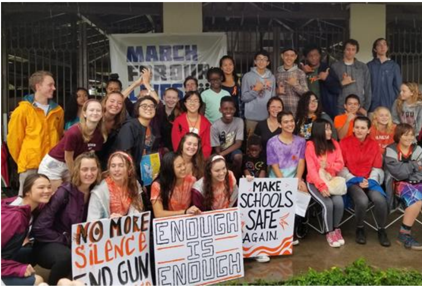
Student Organizers at Ala Moana. Average age: 15

Our Lives event at Ala Moana Beach Park. The rainy weather did not dampen their spirits and instead left the crowd inspired to continue working to make the world a better place. We are in communication with these young, emerging leaders and look forward to seeing what their next steps will be as we come together to advocate for change.