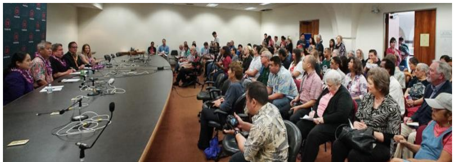
A packed house at our Legislative Wrap Up event with Civil Beat