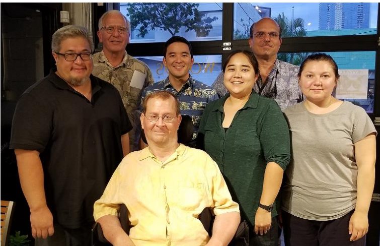
Common Cause Hawaii Board members, staff, and intern

In the last newsletter, we called upon your generosity to raise $5,000, which was matched dollar-for-dollar by a generous donor, in our first ever Hawaii matching gift campaign. Once again you came through in a big way, allowing us to exceed our goal. Your contributions directly support our advocacy efforts and assist in the expansion of our outreach programs. If you would like to contribute, please visit hi.commoncause.org to donate online or send a check to 307A Kamani St. Honolulu, HI 96813.