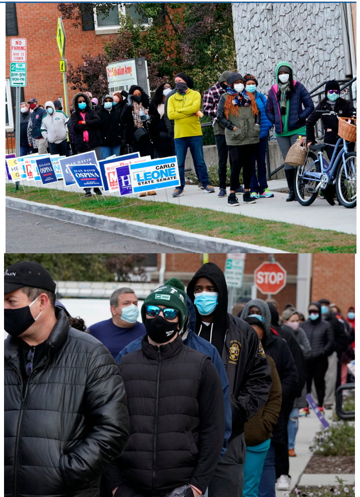
Voters wait to cast their ballots at the Salvation Army of Stamford, Connecticut on November 3, 2020.

With Black and Latino voters facing longer voting lines, no early voting (as of yet), and limited access to absentee voting, Connecticut has some of the most restrictive voting laws in the nation. Conditions that can foster voting discrimination — such as unfair districts or at-large systems that weaken Black and Brown voting power, inaccessible polling locations, insufficient language assistance for voters who don't speak English, and even outright voter intimidation — endure throughout the Nutmeg State. One reason why is that many voting rights abuses happen at the local level, where the legal tools and resources to investigate and prosecute wrongdoing aren't available.