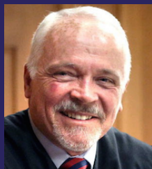
Former La Crosse County Circuit Court Judge Hon. Dale Pasell