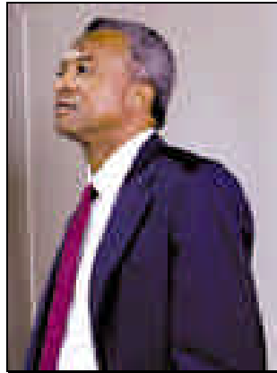
Stanley O'Neal LMDC Board Member