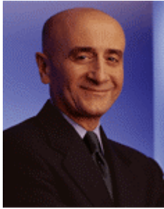
Richard Grasso LMDC Board Member