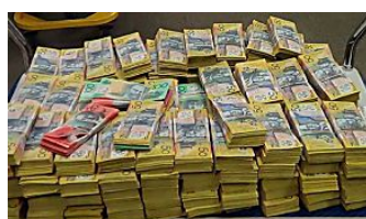
Homeowners Must Claim their $4271 Before End of 2016. Sponsored | FetchRate