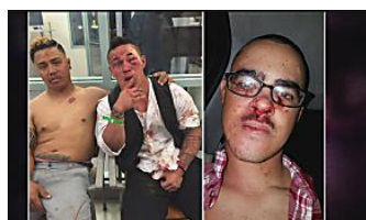
Brutal beating by bouncers at M Nightclub