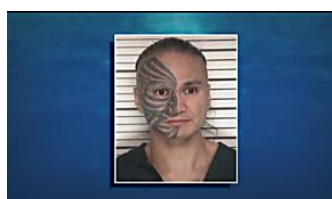
EXCLUSIVE: 'Most wanted' fugitive killed in Hilo police shooting