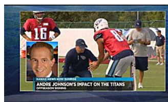
Mariota Impresses Teammates with Meticulous Behavior