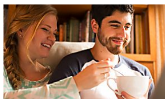
Cereal and milk are associated with lower BMI: find out why. Sponsored | Kellogg's Open For Breakfast