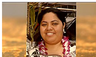
Former Kalaeloa homeless shelter employee charged with theft of more than half a million dollars