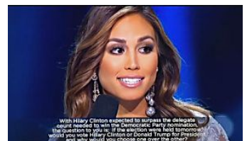
After tough question in finals, Miss Hawaii USA gets the last laugh