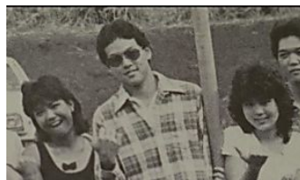
U.S. Rep. Mark Takai dies at 49 after battle with cancer - Hometown reaction