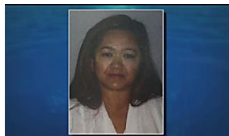
Honolulu Charter school principal, administrator arrested