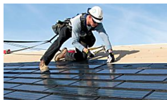
Thinking About Going Solar? Read This First