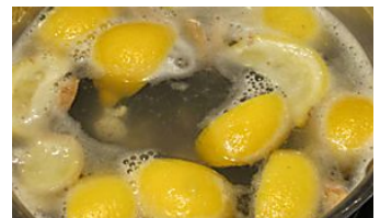
How To Fix Your Fatigue And Get More Energy