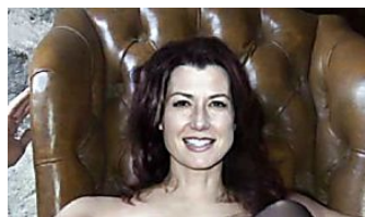
Why Amy Grant Chose The Gays Over God