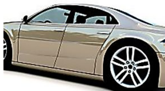
2016's Best Luxury and Mid-Sized Sedans