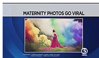
MATERNITY PHOTOS GO VIRAL