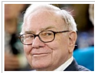
Rumor has it this stock might explode. Can you turn $5,000 into $500,000?