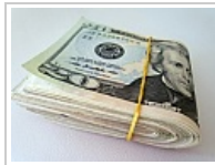
Texas Will this stock explode? Can you turn $1,000 into $100,000?