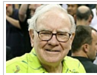
Texas Will this stock explode? Can you turn $1,000 into $100,000?