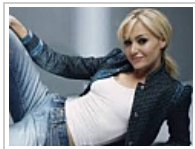
20 celebrities we didn't know were gay before they came out.