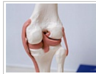
Surprisingly simple solution to help your joints. See why these ingredients are flying off shelves