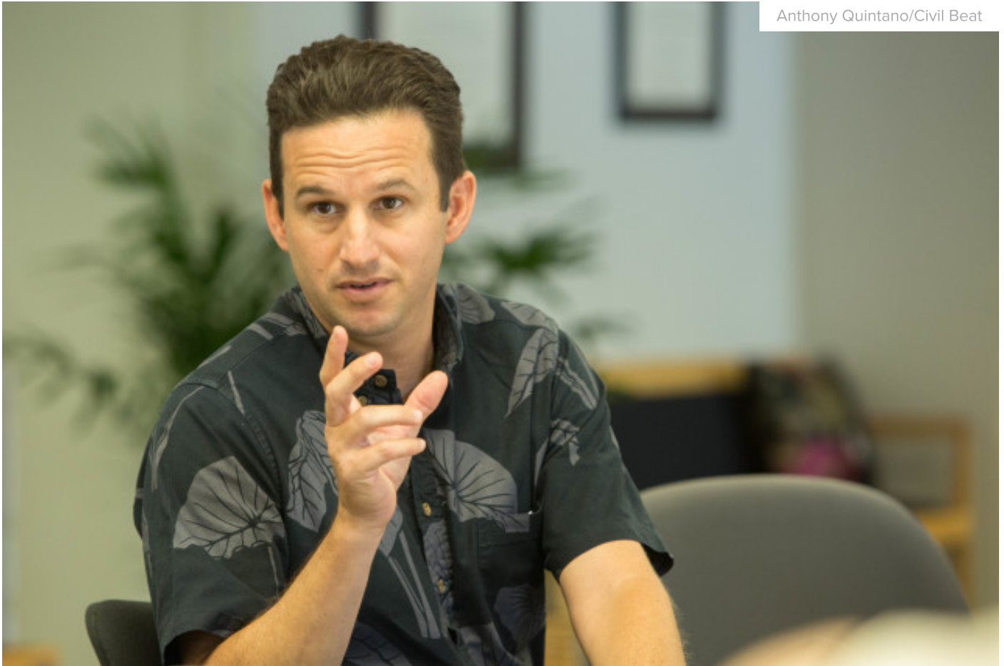
Sen. Brian Schatz in Civil Beat's office in May.

Still, Schatz's Hawaii PAC, which was formed in 2014 — two years after Hirono's Pineapple PAC was launched — did manage to pull in a total of $220,350 in contributions as of March 2016. That's according to the Center for Responsive Politics' Open Secrets and Federal Election Commission records.