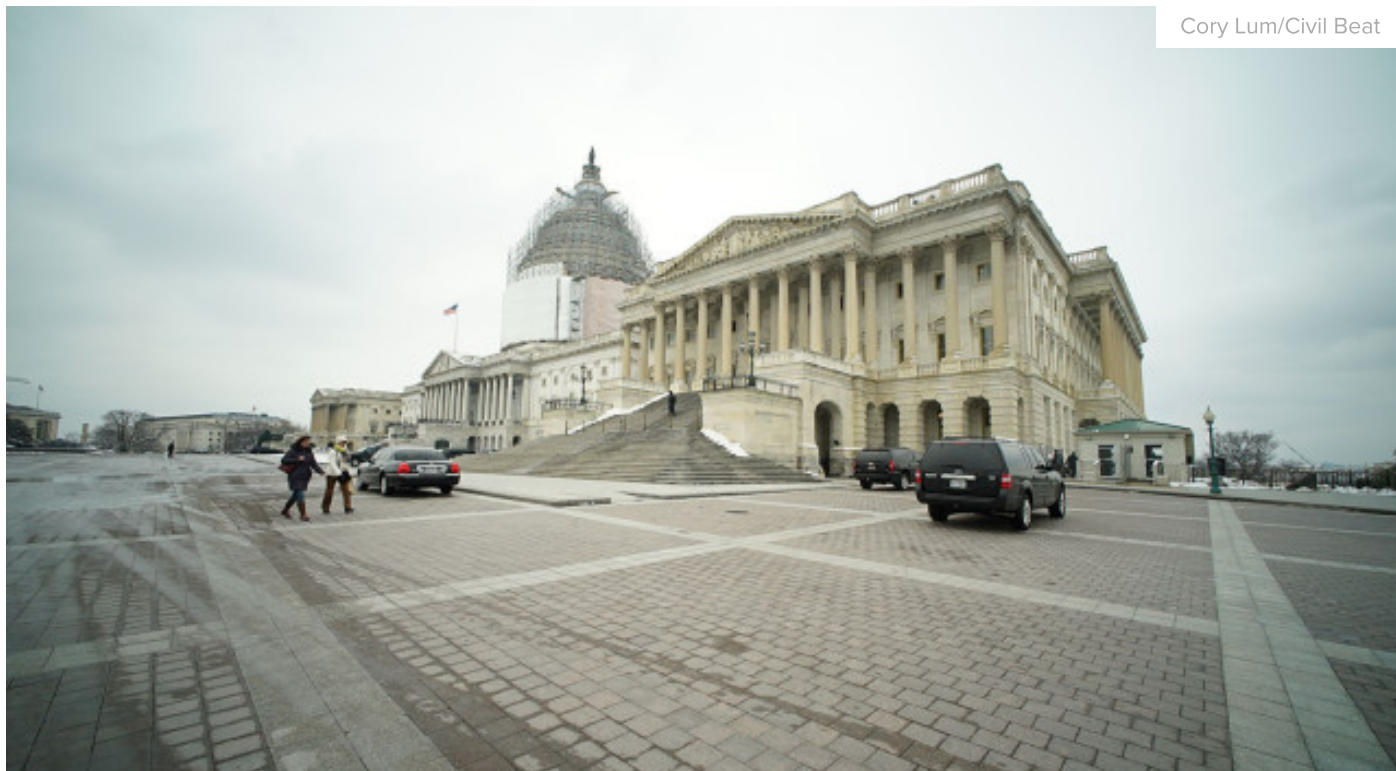
Control of the U.S. Senate is up for grabs this election year.

Open Secrets says the top industries contributing to Hawaii PAC include telecom services, insurance interests, railroads, transportation unions and accountants.