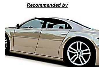
Recommended by Best New 2016 Sedans Promoted By Yahoo Search