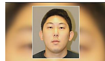
Hawaii Uber driver charged with rape of a teenager