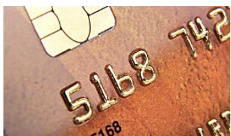
The 10 Best Travel Credit Cards Of 2016 Promoted By CreditCards.com