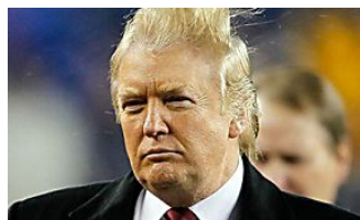
Trump's IQ Will Shock You Promoted By Choice or Life