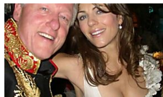
I Was A Hillary Clinton Voter Until I Saw This Promoted By UpVibes.com