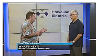
Merger effort ends, Hawaiian Electric moves forward