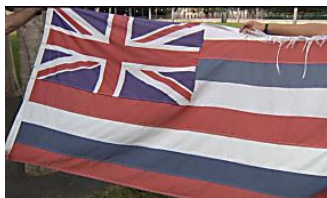
Mistakes being found in Hawaiian flags around Honolulu