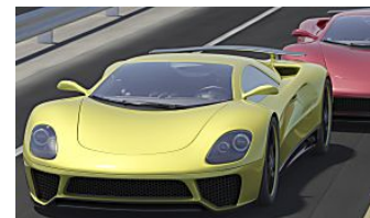
These are the Best Luxury Cars on the Market