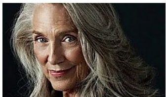
68-Year-Old Grandma Gets Her 35-Year-Old Face Back. See The Stunning Photos