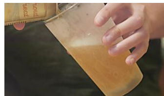
Say No To Frosted Pint Glasses