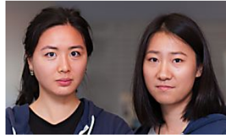
How 2 Boston Grads Are Disrupting a $19 Billion Industry