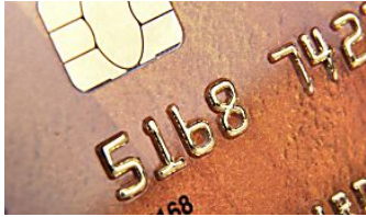
A Jaw-Dropping 18-Month 0% APR Credit Card