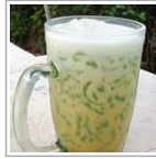
Watch: Alzheimer's Reversal "Cocktail" Changing Lives