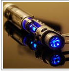
Police Urge Americans To Carry This With Them At All Times