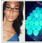
New "Limitless-Like Pill" Sells Out in 17 Hours