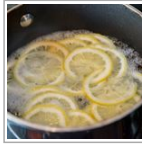
How To Fix Your Fatigue And Get More Energy