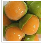
1 Fruit That "Destroys" Diabetes