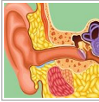
1 Method "Ends" Tinnitus (Try This Tonight)