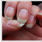
10 Hidden Signs of Alzheimer's Disease