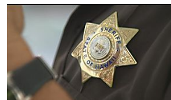
EXCLUSIVE: 15 deputy sheriffs headed to class because they lack law enforcement training