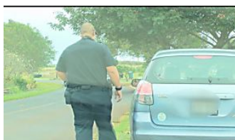
Lawmakers seek to make clear public's right to film officers