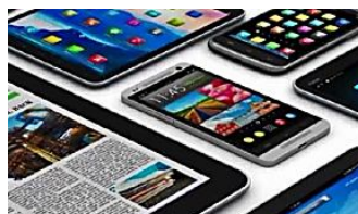
Best Smartphones 2016: What You Should Know