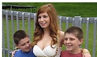
Bizarre Family Photos That Will Make Your Skin Crawl