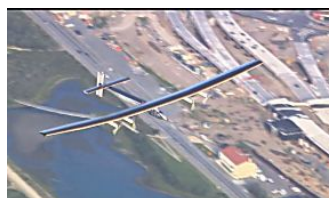
Solar Impulse 2 plane lands successfully in California 9PM