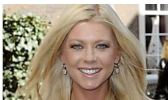
40 Actors Who Vanished Without a Trace from Hollywood