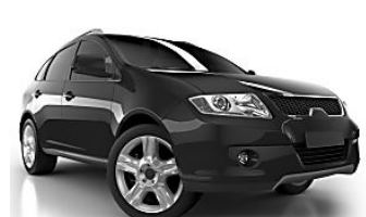
The Best Small, Compact SUVs