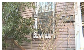
Police: Woman mauled to death by her dog