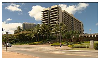
Proposal: Cut counties out of 'room tax' revenues