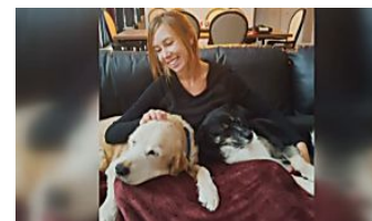
Woman blames airline for dog's death