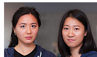
This Brilliant Move By 2 Boston Grads Is Disrupting a $19 Billion Industry