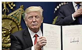
Trump Is Giving Homeowners Until February 28th To Claim Their $4,240 Federal Rebate!