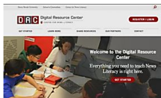
The new civics course in schools: How to avoid fake news