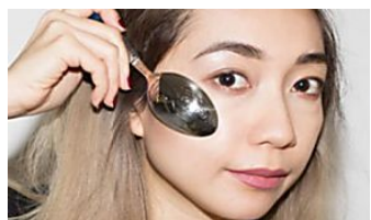
How To: Get Rid of Dark Under Eye Circles [Watch]