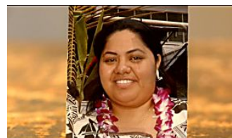
Former Kalaheo homeless shelter employee charged with theft of more than half a million dollars