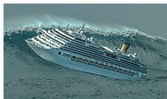
16 Things Cruise Ships Keep Hidden from Customers