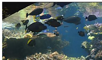
Creative fundraising keeps Honolulu Aquarium afloat