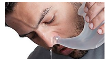
How To: Remove Dark Under Eye Circles