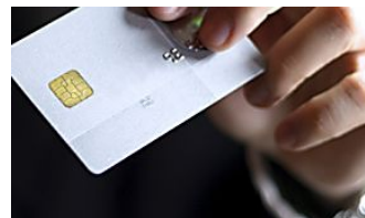
The Fastest Way To Pay Off $10,000 In Credit Card Debt