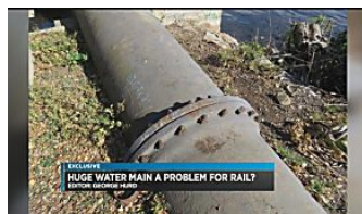
EXCLUSIVE: Rail project faces potentially costly obstacle in Dillingham area