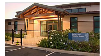
EXCLUSIVE: Maili PCB contamination