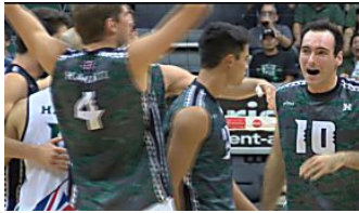
#4 Rainbow Warriors demolish #10 Pepperdine