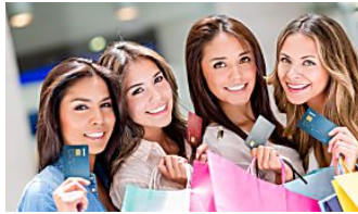
Cards With Outrageously Long 0% APRs Sponsored | Credit Cards