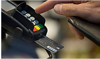
There's a Problem With the New Chip Credit Cards Sponsored | AARP