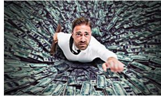
The Fastest Way To Pay Off $10,000 In Credit Card Debt Sponsored | NerdWallet