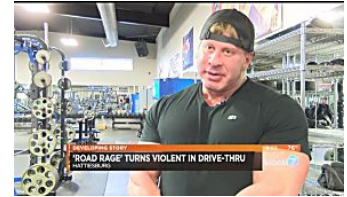
'Road rage' incident at Arby's drive-thru turns violent