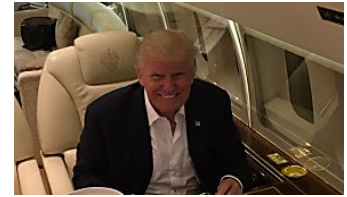
President Trump, About Your Diet -- We'd Like to Help Sponsored | personaltrainerfood