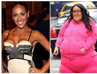
(http://gossipobster.com/30-celebrities-whove-gained-weight/?utm_medium=content&utm_source=adt) Shocking Photos Of Hollywood's Sexiest Stars That Have Gained Some

Copyright © 2016 The Washington Times, LLC.