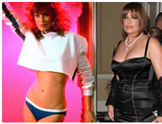
(http://buzzbombed.com/you-wont-believe-how-badly-these-celebs-aged/?utm_source=ab&utm_medium=cpc&utm_term=[EncodedAdbladeTracker]) Once-hot celebrities that turned ugly with age. (http://buzzbombed.com/you-