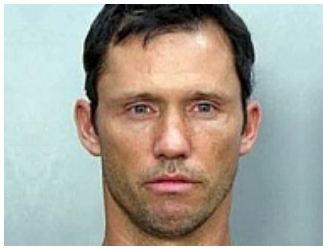
(http://adrzr.com/h96?utm_medium=cpc&utm_campaign=e422_US_desktop_CrimesJeffD6.9_1_h96_2&utm_term=[EncodedAdbladeTracker]) 15 Famous Celebs Who Have Committed Horrible Crimes (http://adrzr.com/h96?