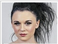
Houston arrest records. Who do you know?