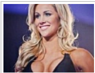
Current & former NFL players are notorious for their hot wives & girlfriends. Here's 20 of them.