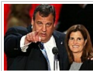
Chris Matthews has no limits. See what he said about Chris Christie and his innocent wife.