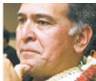
The Senate majority leader, author of the bill, called it "a starting point" for discussion