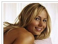
Former Baltimore cheerleader Stacy Keibler has turned many male fans into Raven maniacs.