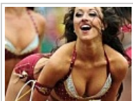
Here are 25 of the hottest cheerleaders on NFL sidelines.