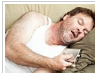
Cumbersome CPAP machines or risky surgery are not the only answers to solving sleep apnea.