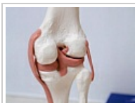
Surprisingly simple solution to help your joints. See why these ingredients are flying off shelves