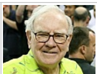
Texas Will this stock explode? Can you turn $1,000 into $100,000?