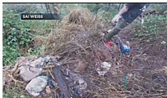
Police say foul play involved after human remains discovered near Tantalus Drive