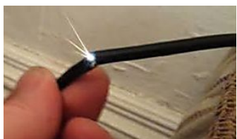
U.S Shocked After Hundreds Stop Using The Internet Today Promoted By Tech News