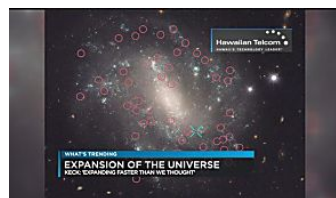
What's Trending: Keck Universe expansion, hanging snakes, dangerous birthday cake