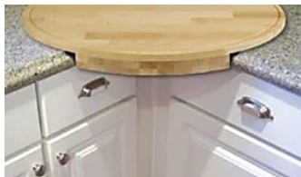
You Need More Room In Your Kitchen? You Must See These Tricks