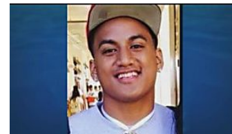
Family: 16-year-old fatally stabbed in Kalihi was 'taken too soon'