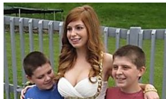
Bizarre Family Photos That Will Make Your Skin Crawl